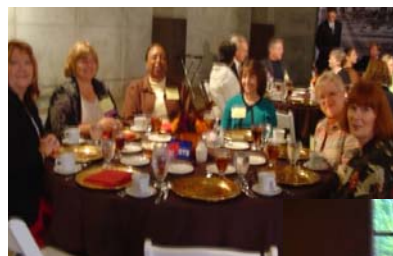
KCMPI members enjoy lunch sponsored by Eddy's catering and Majestic Steakhouse.