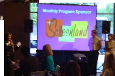
October's meeting location, Screenland